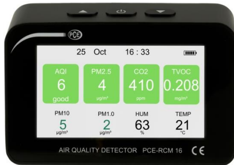
Figure 1 Standard view