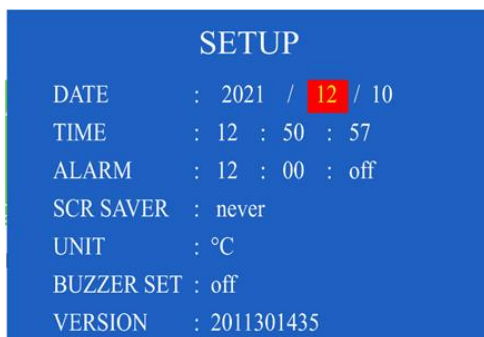
Figure 4Setup menu

Note: The unit can also be operated permanently with a mains adaptor.