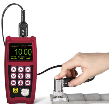
Measuring through the coating