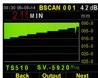
Display B Scan Graph