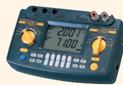
Multi-functional Calibrator CA71