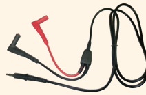
Output cable Model: 98076