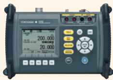
Pressure Calibrator CA700