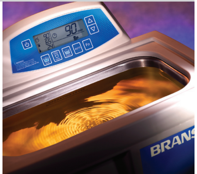
Branson CPX Series

The CPX Series extended degassing capabilities (up to 99 minutes) allow for “beyond cleaning” applications for sample preparation such as mixing and homogenization, dissolving solids, cell lysing, and particle dispersion.