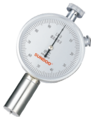
Shore D Analog Durometer