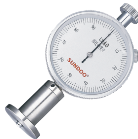
AO Analog Shore Durometer