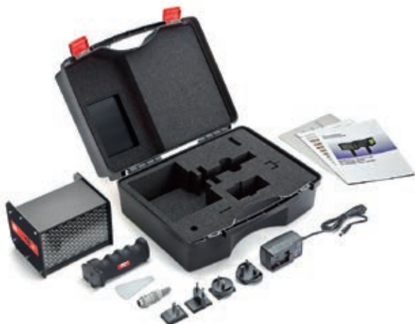
Operating instructions, calibration certificate, charger with connector set, trigger plug, reflective tapes (Version super qbLED), handle, case.

Example: when scanning a cog wheel, an external trigger (e.g. rotational speed sensor) sends out a signal for each cog scanned. With a DIV value of 10, it will only flash once in every 10 signals.