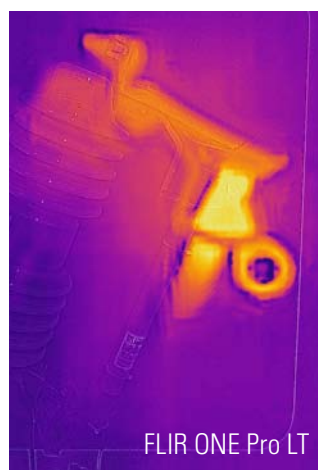
FLIR ONE Pro LT