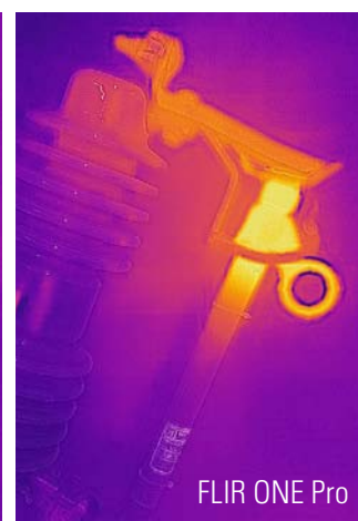
FLIR ONE Pro