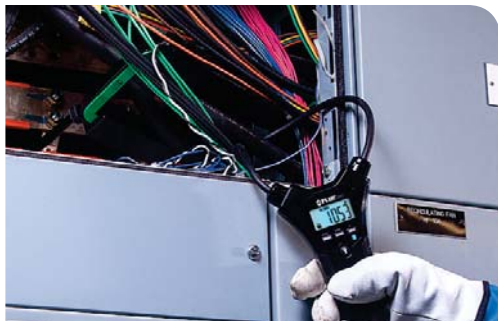
FLIR CM57's Flexible Cable works into tight areas