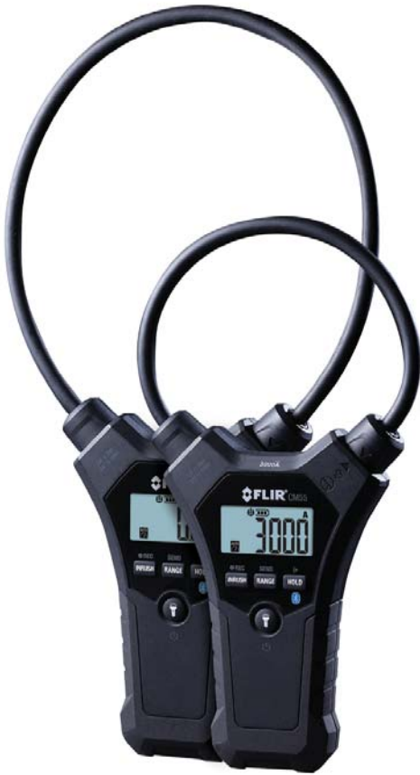
CM57 & CM55 Flexible Clamp Meters