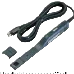
Handheld sensor specifically for blue-violet optical lasers