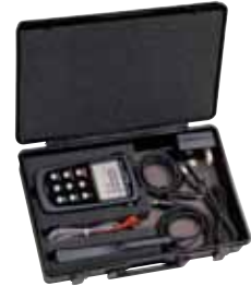
Handy for travel and storage

Optical Power Meters installed with firmware version 1.01 or earlier must be updated to support compatibility with the new Optical Sensor 9743/9743-10