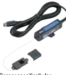
Sensor specifically for blue-violet optical lasers (detachable model)