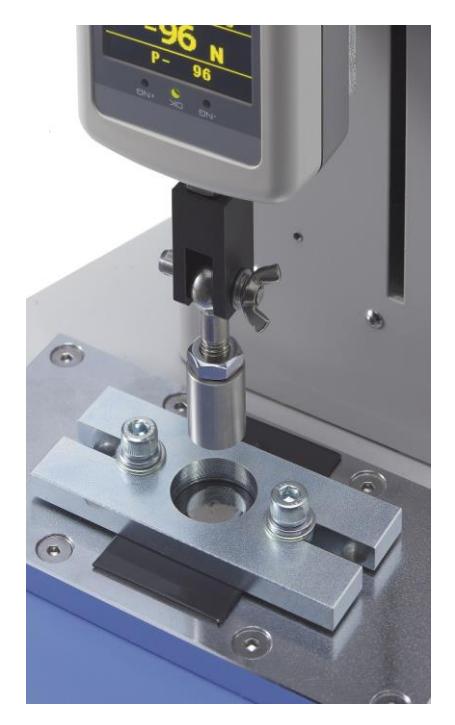
TH-5000N-20 Testing Image