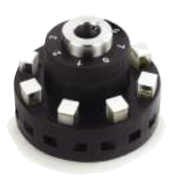
Eight-position cell holder

Multiple kinetics measurements can also be run in parallel by automatically staggering the time of measurement for each sample fitted in the cuvette changer.