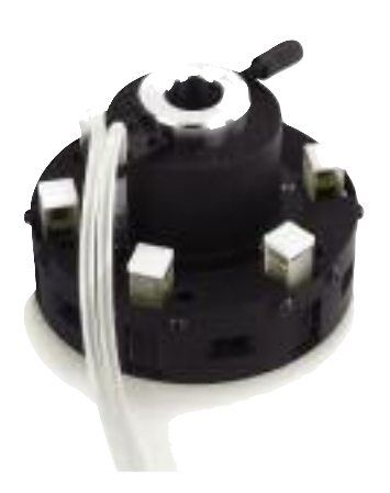
Six-position cell holder