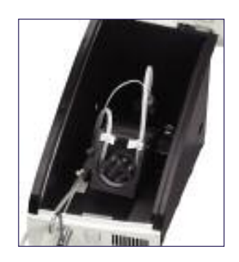
Sampling accessories include (I to r) single cuvette holder, automatic eight position cuvette holder, sipper pump and peltier/sipper.