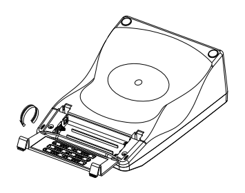
Figure 1: Battery compartment