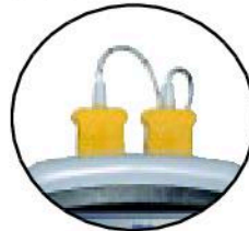
Single or Dual Thermocouple Input