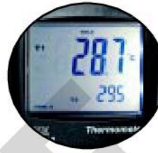
Large, easy-to-read LCD display with backlight